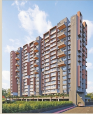
Shanti Kishan Dahisar (East)