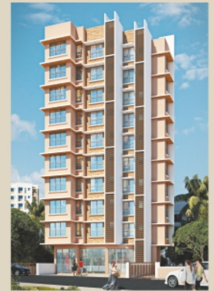
Shilp Taru CHS Ltd. Dahisar (East)