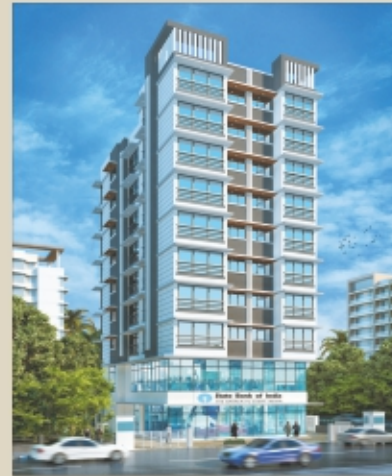
Amrapali CHS Borivali (West)