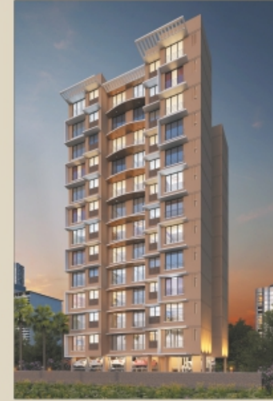
Dev Ashish CHS Ltd. Malad (East)