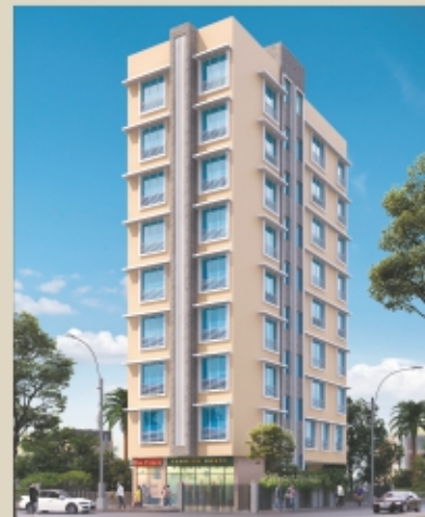
Barkat Villa Dahisar (East)