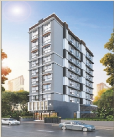
Sheetal CHS Ltd. Borivali (West)