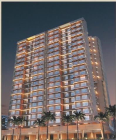
Zen Garden Kandivali (West)