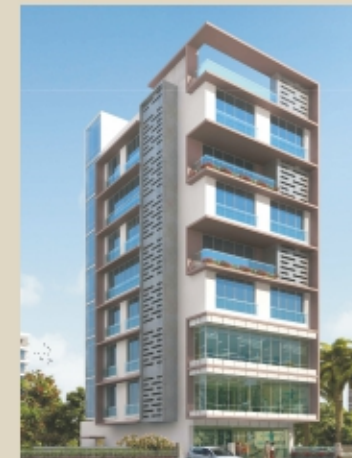
Konark Apartment Borivali (West)