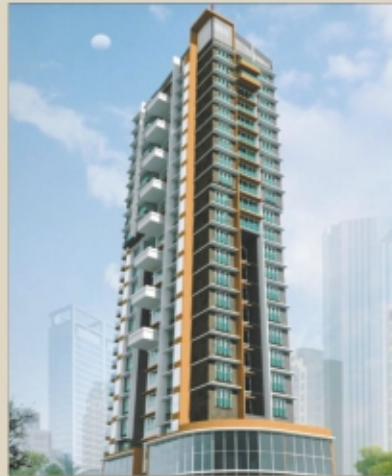
Kailas CHS Ltd. Borivali (West)