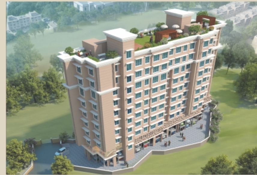
Alpha Residency Borivali (West)