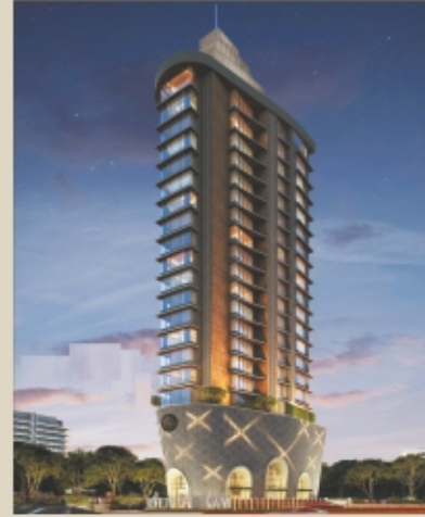
Konark Elegance Borivali (West)