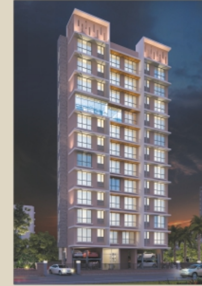
Navjeevan CHS Ltd. Malad (East)