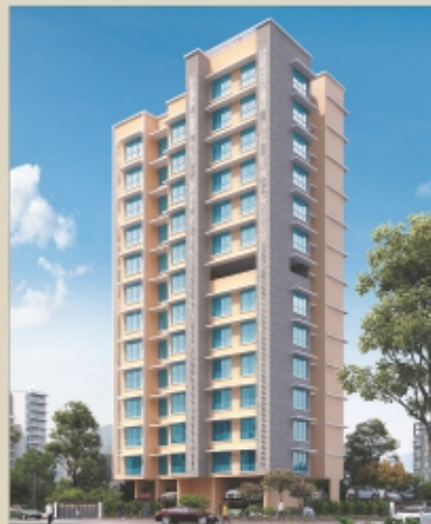
Vishwa Prakash CHS Ltd. Dahisar (East)