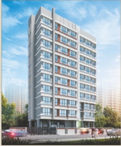
Aakansha CHS Ltd. Borivali (West)