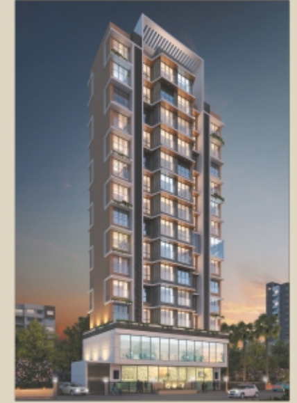
Tara Galaxy Kandivali (West)