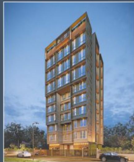
Samarpan Borivali (West)