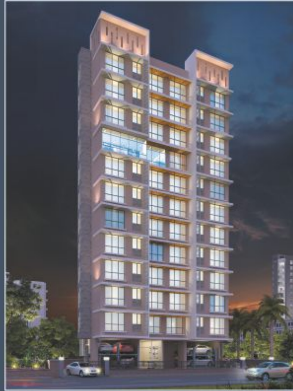
Navjeevan CHS Ltd. Malad (East)