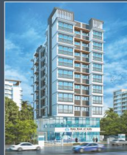
Amrapali CHS Borivali (West)