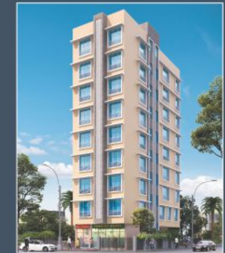
Barkat Villa Dahisar (East)