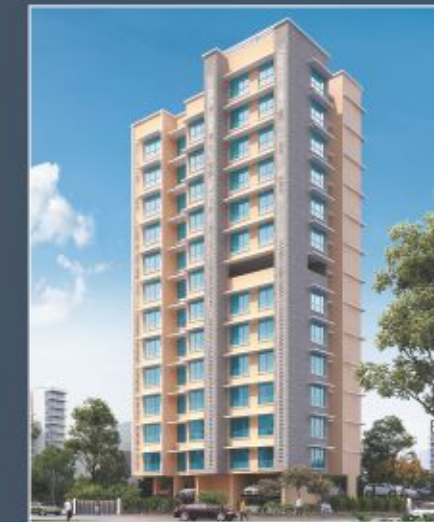
Vishwa Prakash CHS Ltd. Dahisar (East)