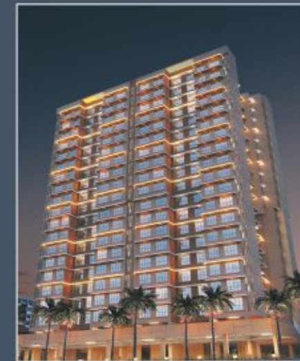
Zen Garden Kandivali (West)