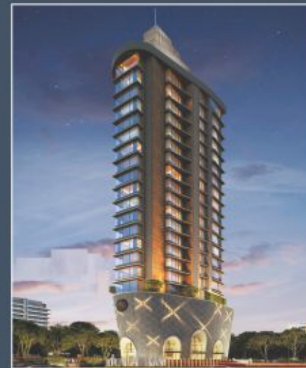
Konark Elegance Borivali (West)