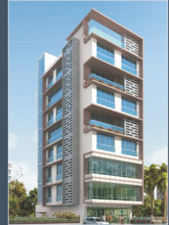
Konark Apartment Borivali (W)