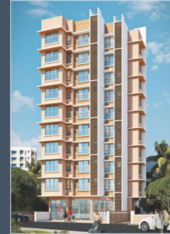
Shilp Taru CHS Ltd. Dahisar (East)