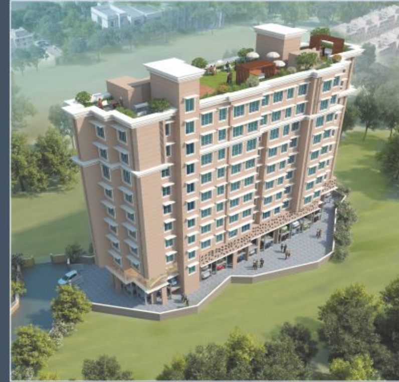
Alpha Residency Borivali (West)