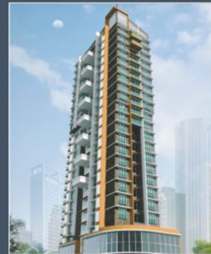
Kailas CHS Ltd. Borivali (West)