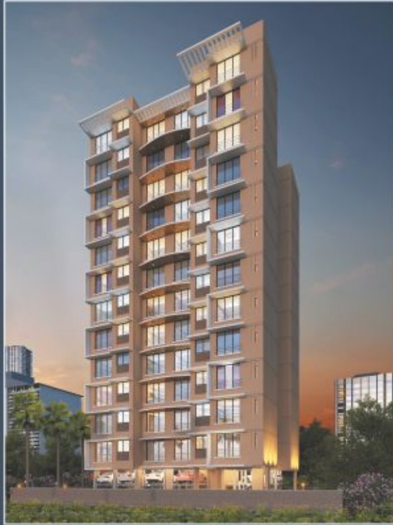
Dev Ashish CHS Ltd. Malad (East)