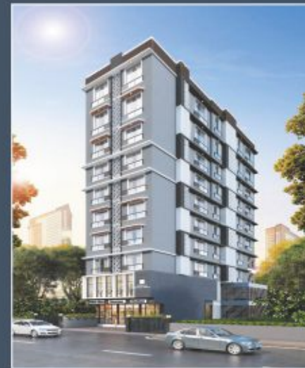
Sheetal CHS Ltd. Borivali (West)