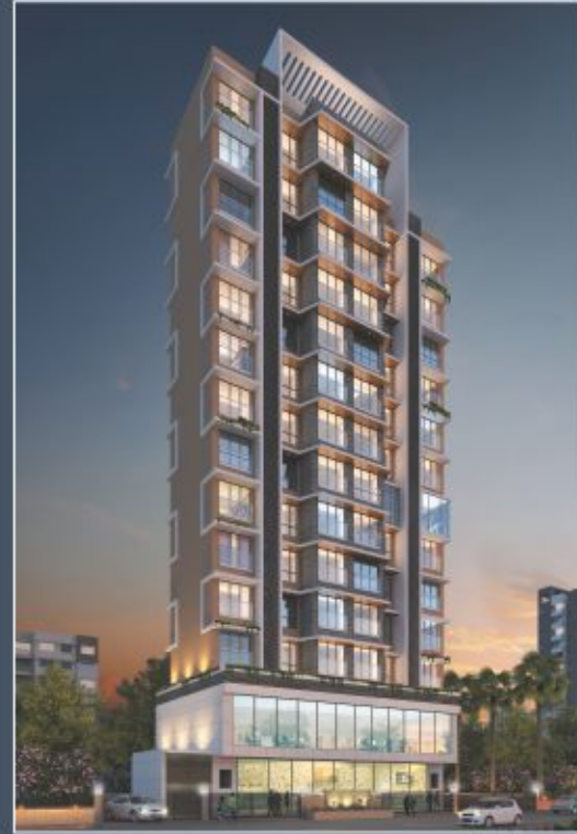
Tara Galaxy Kandivali (West)