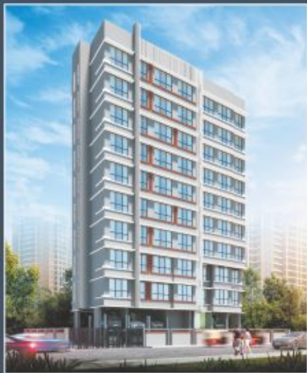
Aakash CHS Ltd. Borivali (West)